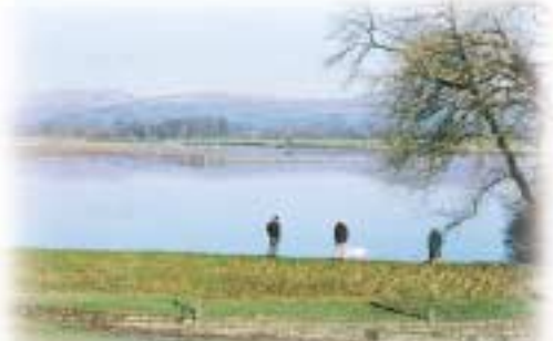
Winter floods above Loyn Bridge

The flora and fauna match the diversity of the land. The dales, woodlands and lanes are blessed with a wealth of wild flowers. The pastures are mainly given over to sheep farming, but from the pockets of woodland and parkland emerge wandering deer. On the higher ground hen harrier, buzzard and kestrels quarter the skies above fox and rabbits in the fields.